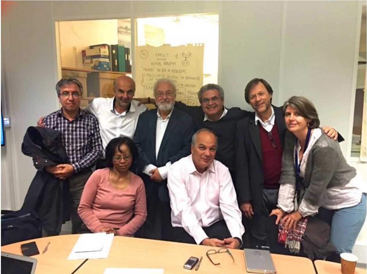
Steering Committee for the Network strategy (SCS)